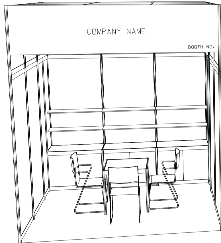
PERSPECTIVE 3M(W) X 3M(D) X 3.5M(H)