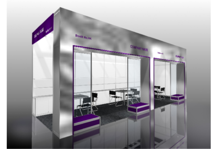
COLOUR PERSPECTIVE N.T.S