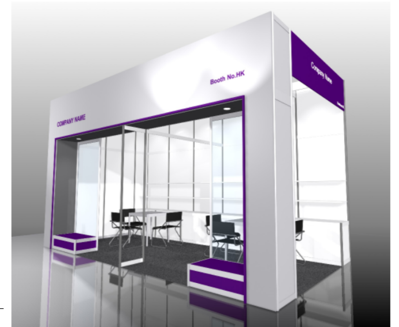
COLOUR PERSPECTIVE N.T.S