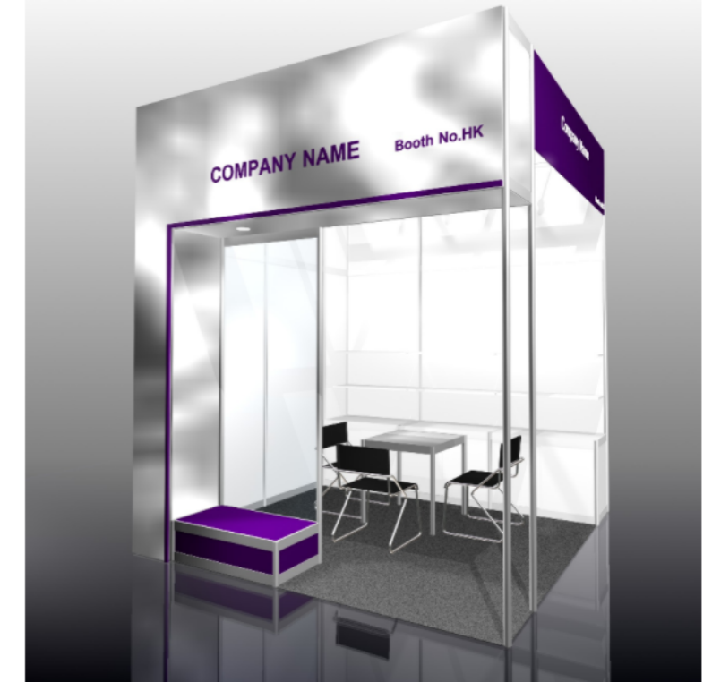
COLOUR PERSPECTIVE N.T.S