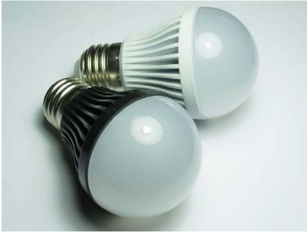
All Plastic Luminaries by iBrain Technology Ltd – Hong Kong Product Zone: Hall of Aurora Booth no.: 1E-D25