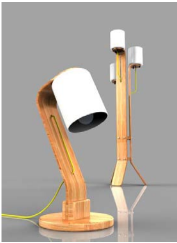
Design Table Lamp and Floor Lamp by Dreambox (HK) Ltd. – Hong Kong Product Zone: Decorative Lighting Booth no.: 1C-F15