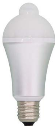
Motion Sensor LED Bulb by Acrox Technologies Co., Ltd. - Taiwan Product Zone: World of LED - Indoor Booth no.: 3C-E13