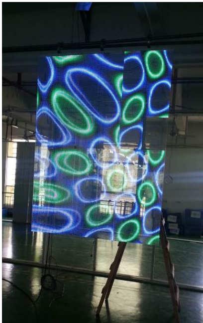
Window by Flex Boxlight Co., Limited - Hong Kong Product Zone: Display World Booth no.: 1C-A02