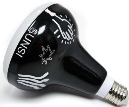
Multi-Purpose Decorative LED Light (PAR38) by Sunsi Australia Power Energy Ltd - Hong Kong Product Zone: Hall of Aurora Booth no.: 1E-B28